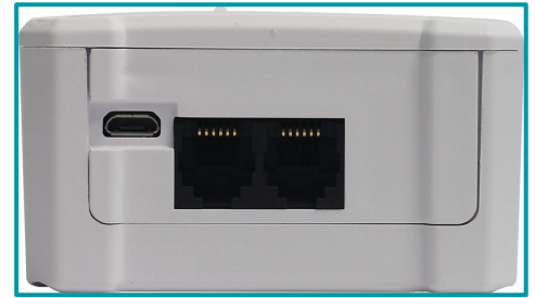
Subtitle: Image of the front view and the Endpoint LoRa connections.