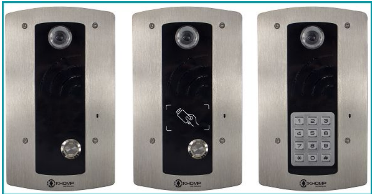
Subtitle: Front of the IP Wall 301 S, IP Wall 301 SR and IP Wall 32 S models.