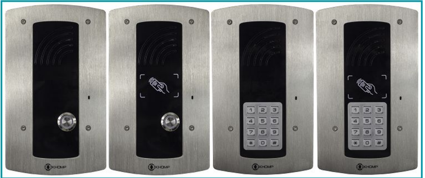
Subtitle: Front of the IP Wall 301 S and IP Wall 312 S models (examples without reader and with integrated RFID reader).