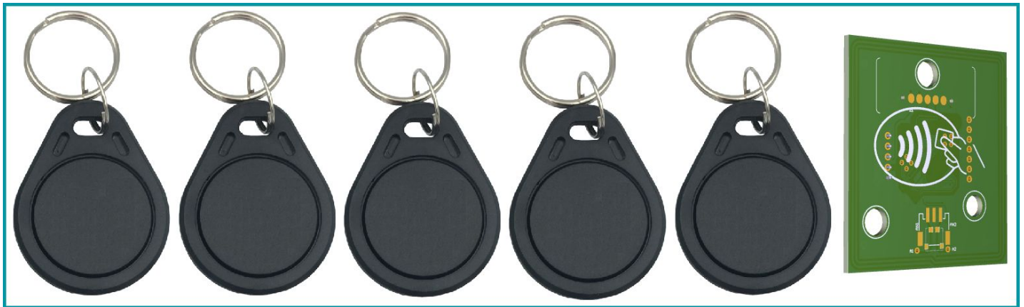
Subtitle: Set of 5 tags and RFID board.