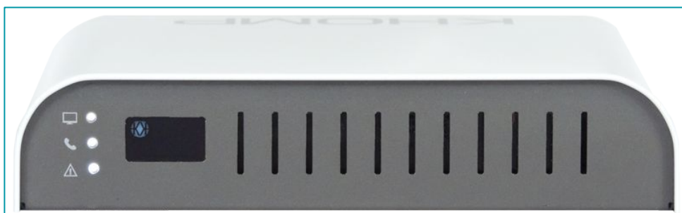
Front view - With display