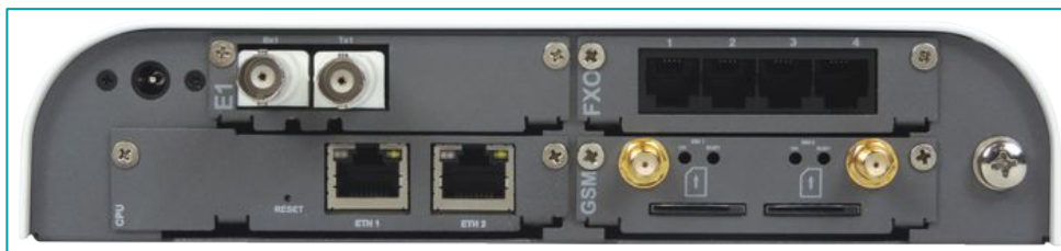
Rear view - 1E1 + 4FXO + 2GSM