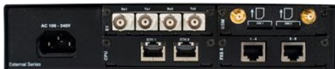
Example of assembly with 2 E1, 2 GSM and 4 FXO