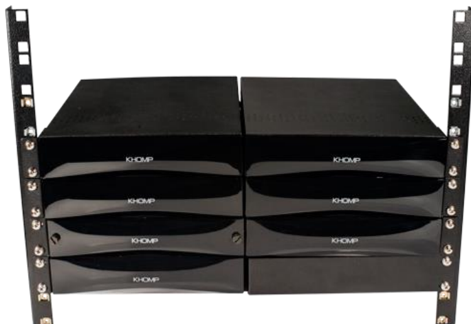
Example of 7 EBS modules arranged in a standard 19" rack