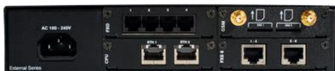
Example of assembly with 4 FXO, 2 GSM and 8 FXS