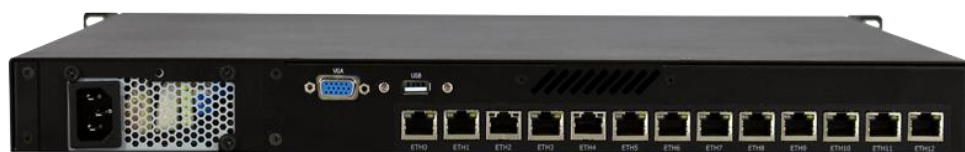
Rear view - A130x Model