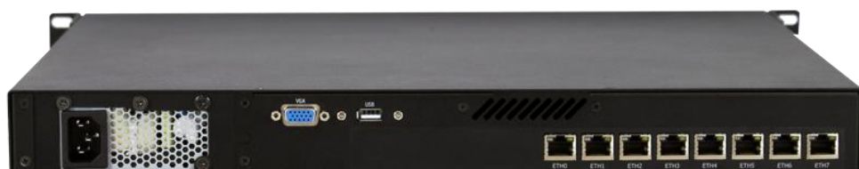
Rear view - B801 Model