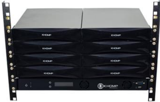
Example of EBS Server PRO assembly with 32 E1/T1 links